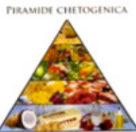
Figure 3.3 Example of image in the booklet 3 – MO respectively

La cosa più importante da tenere in considerazione è che questo tipo di dieta non deve MAI essere intrapresa in autonomia o con metodiche "Fai da te". Infatti necessita sempre di supplementazioni vitaminico/minerali, garantire l'effetto terapeutico attraverso il giusto equilibrio tra i nutrienti e tenere conto delle eventuali interazioni con farmaci ed altre terapie. Per questo motivo i pazienti sottoposti a questo tipo di terapia devono essere monitorati da un team esperto e devono evitare cambiamenti non valutati prima con il medico/dietista di riferimento