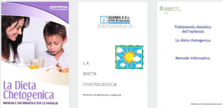
Figure 1. Paper-based informative materials on the KD offered by the centres participating in the research

All caregivers from the centres involved in the investigation were exposed to paper-based information (booklets) about the KD, whereas only the Modena group was also given access to the draft of a/the website and app, as well as to some videos of Keto-recipes created by the dietitians. In order to carry out a homogenous analysis, we decided to take into account only paper-based informative materials and to leave web-based ones to future research. To this end, the centres (see footnote 2) were asked to provide the booklets that health operators give to caregivers during doctor-caregiver encounters and we gathered the three samples in figure 1: