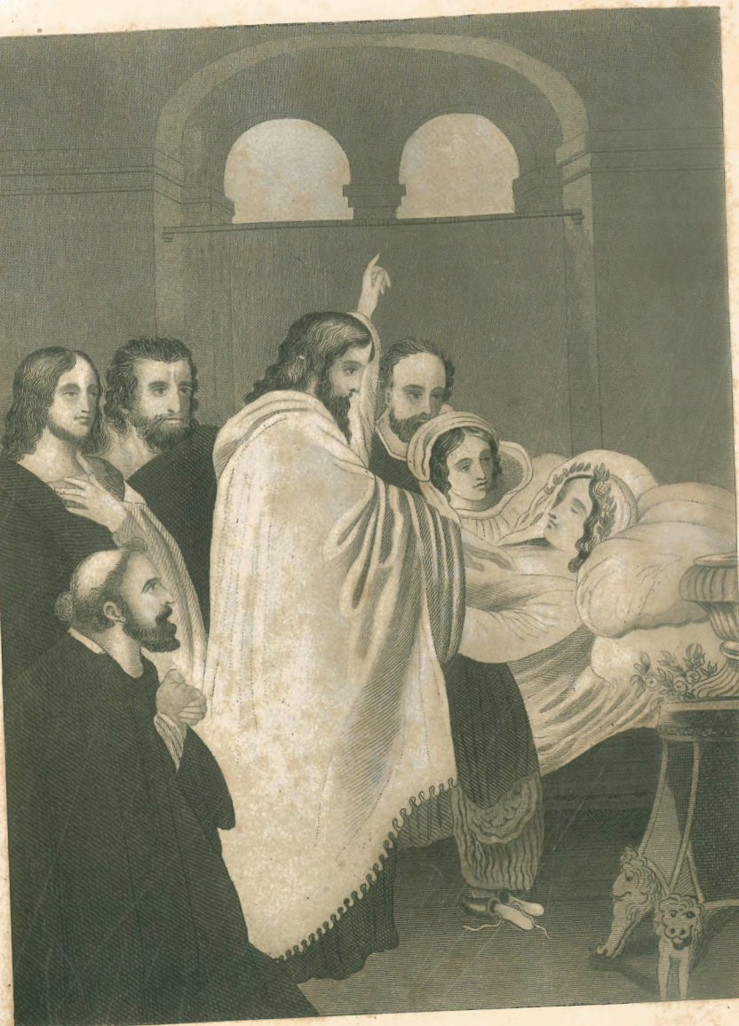
RAISING OF JAIRUS' DAUGHTER