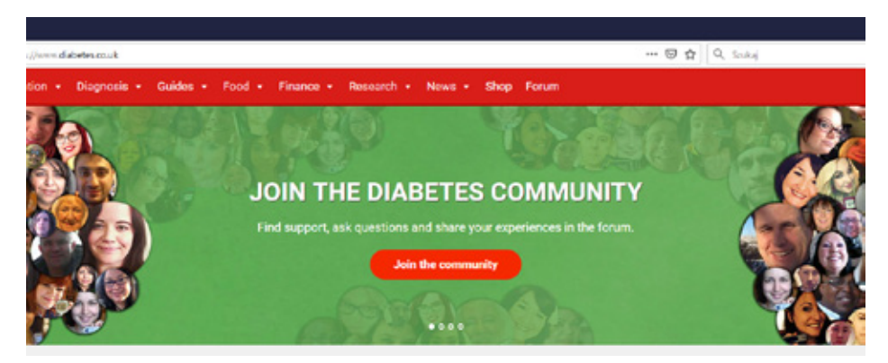
Figure 1. The Diabetes.co.uk forum website

As evident in Figure 1, the Diabetes forum website revolves around the concept of community, calling itself The Global Diabetes Community , reinforced by images of smiling faces to the left and right. At the top of the first strip, there is direct access to other sections focussing on various kinds of diabetes (Prediabetes, Type 1, Type 2..., treatment, complications, insurance, food and recipes, and shopping online). Across the lower strip, in capital letters, there is an invitation to join the Diabetes community, with further invitations in a series of imperatives below: (Find support, ask questions and share your experiences in the forum) and below on a separate line a further invitation, yet again in the imperative form (Join the community).