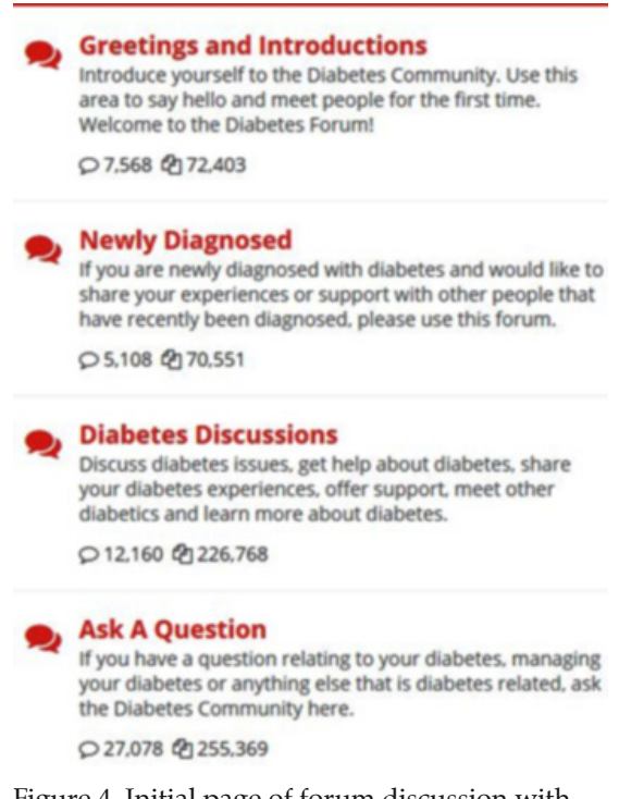
Figure 4. Initial page of forum discussion with number of replies and views

Let us now examine the data in order to see how the discourse evolves in the forum and how it continually works in a stimulus-response pattern. As we shall see, the stimulus is either from the website staff to the patients or among the patients themselves in a peer-to-peer exchanges.