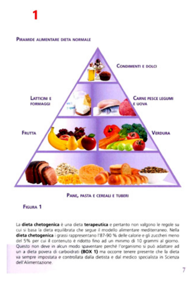
Figure 3.1 Example of image in the booklet 1 – PH respectively

The three booklets combined different textual styles, including both parts in prose with long paragraphs (seven or more lines) and sections using bullet points, numbers, and dashes. On the other hand, five leaflets used enumeration. They all used the same type of font, i.e. where the order of information was unimportant. Four used a font equal or bigger than 12-point and the formatting was consistent with the presentation of the topics, using bold types or underlined for emphasis. In the BO and PH booklets, titles of different sections featured a bigger font or upper-case lettering. All documents included visual material, with some images as part of the explanation and others simply as decoration (See figure 3 for examples from each booklet.).