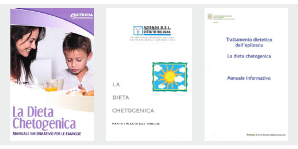
Figure 1. Paper-based informative materials on the KD offered by the centres participating in the research

All caregivers from the centres involved in the investigation were exposed to paper-based information (booklets) about the KD, whereas only the Modena group was also given access to the draft of a/the website and app, as well as to some videos of Keto-recipes created by the dieticians. In order to carry out a homogenous analysis, we decided to take into account only paper-based informative materials and to leave web-based ones to future research. To this end, the centres (see footnote 2) were asked to provide the booklets that health operators give to caregivers during doctor-caregiver encounters and we gathered the three samples in figure 1: